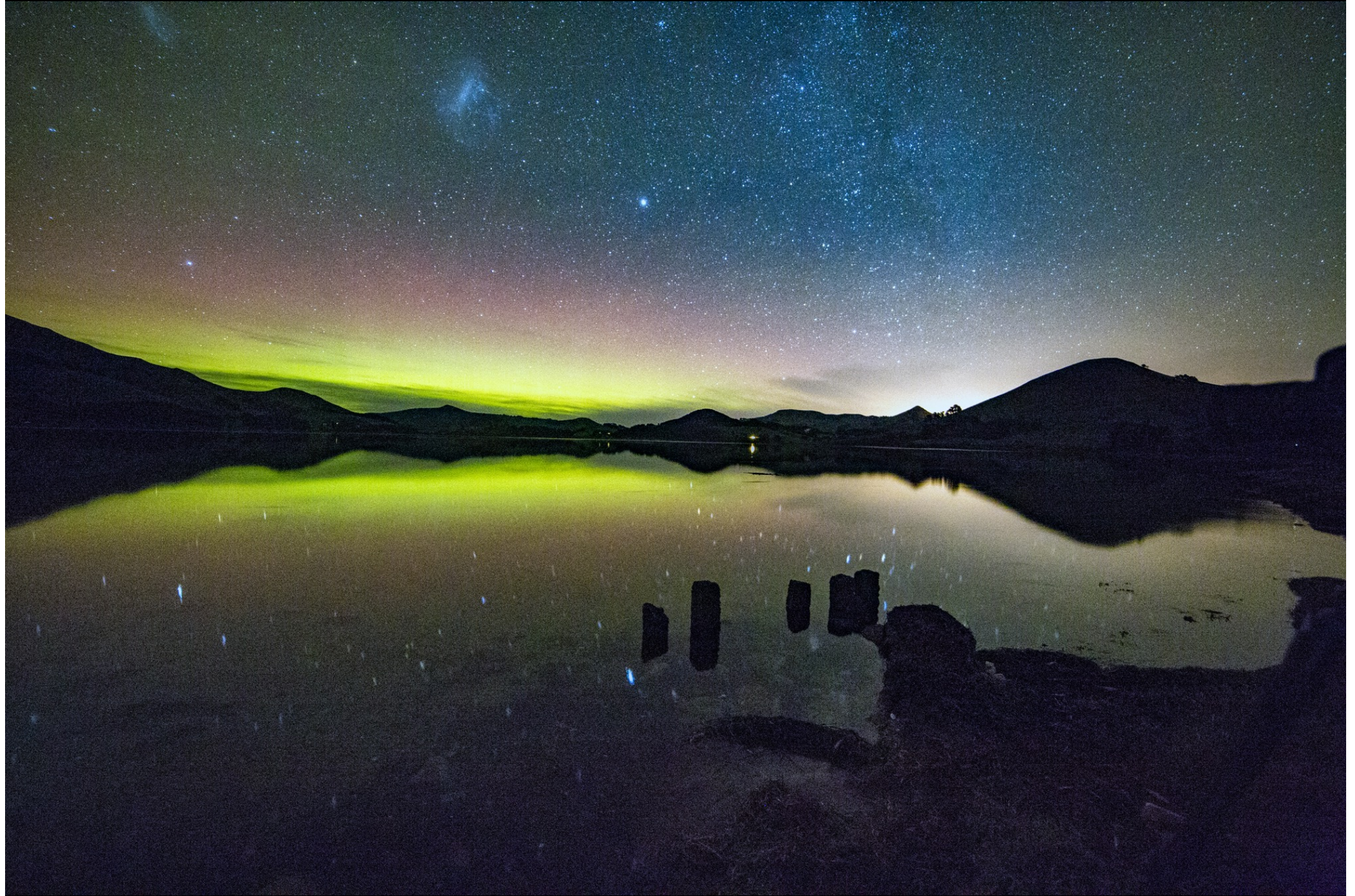
View looking Southwest across Papanui Inlet towards lots 1, 2, 4,& 7