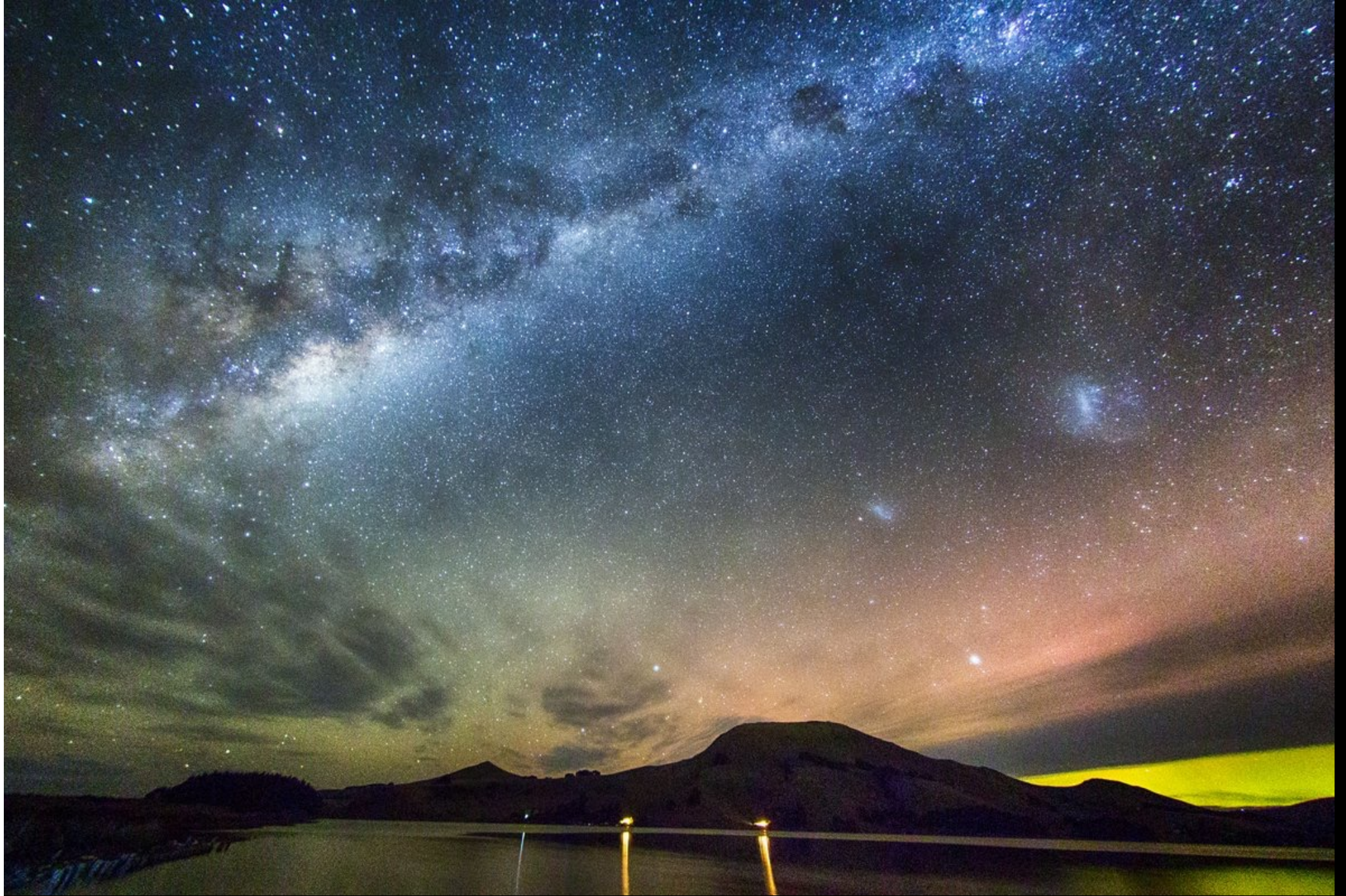
View looking across Papanui Inlet towards Mount Charles. Note impact of existing lights cf Fig 2,3,4 of Moore