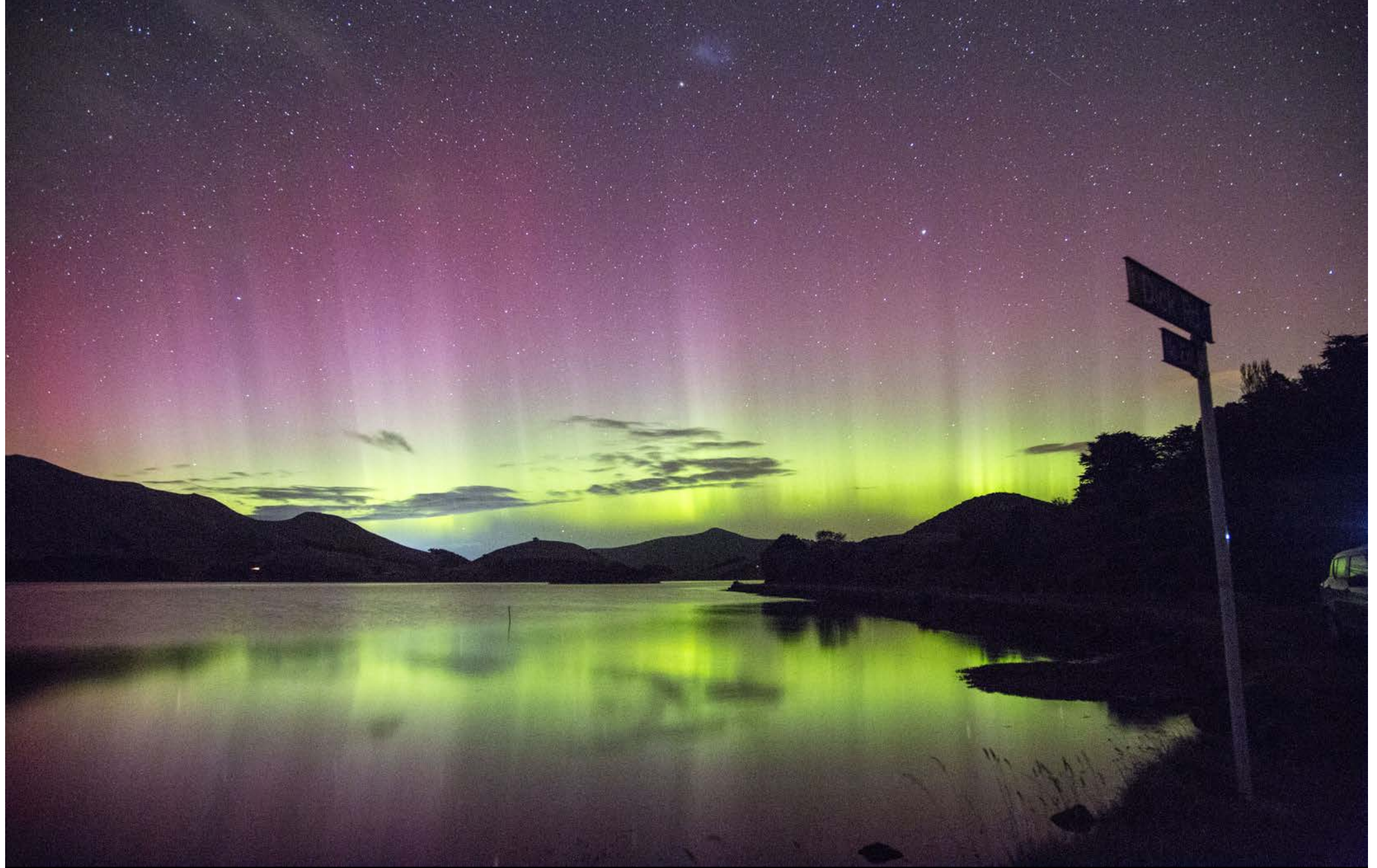
View Southwest across Papanui inlet towards Lots 1, 2 & 4