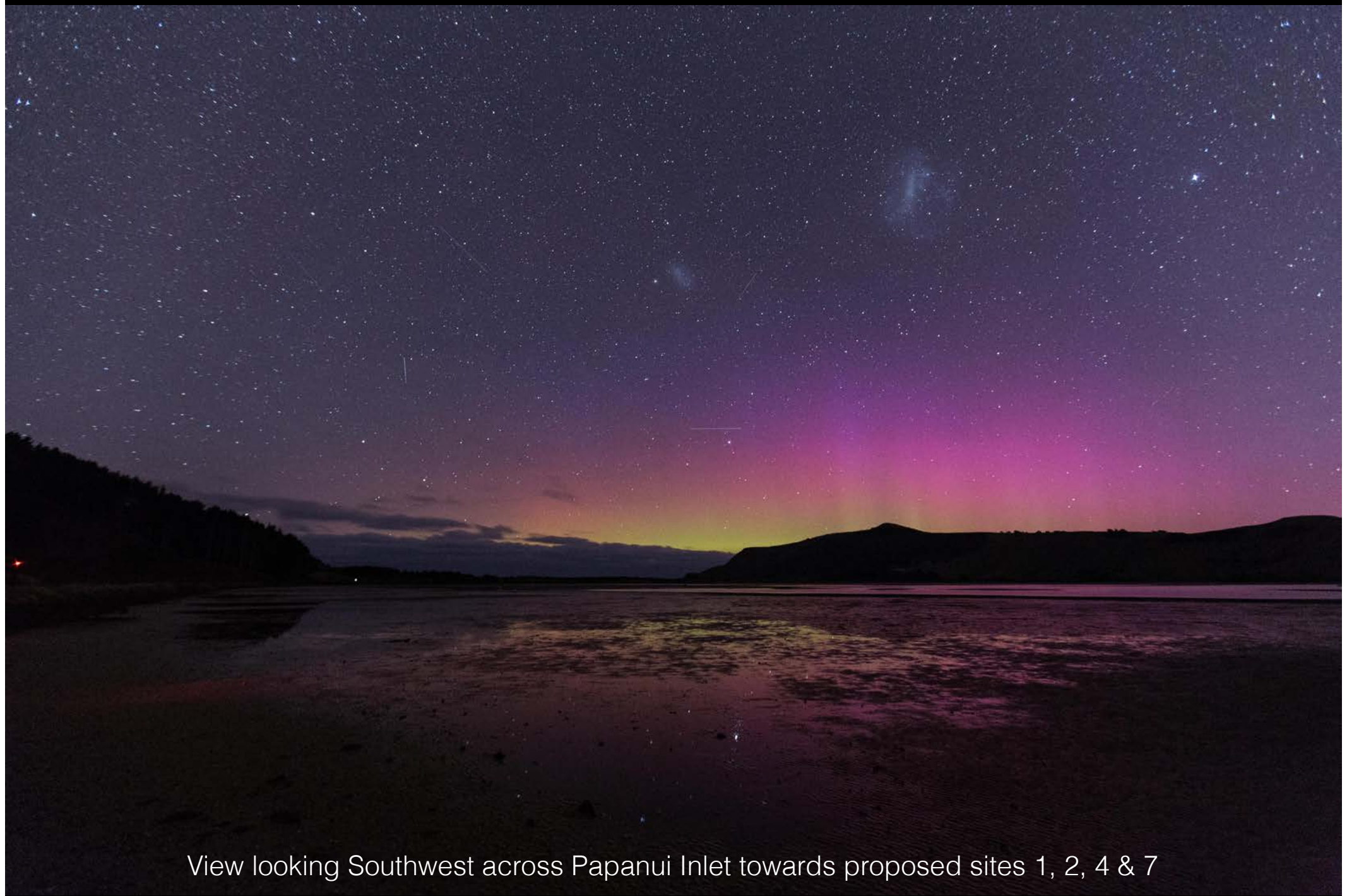
View looking Southwest across Papanui Inlet towards proposed sites 1, 2, 4 & 7