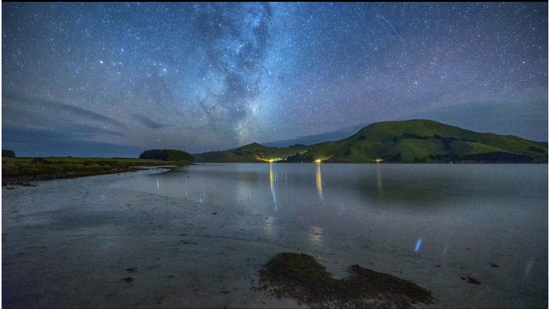
View towards Lot 7. Note impact of reflections from existing houses